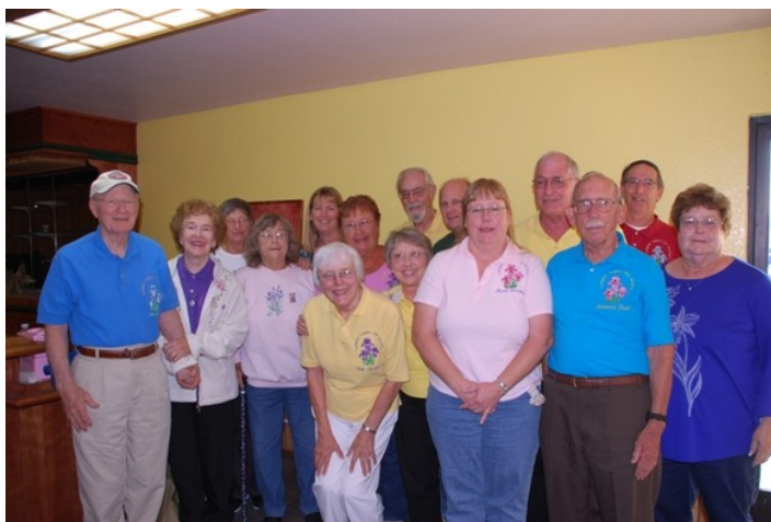
Lompoc Valley Iris Society